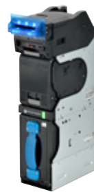
UBA Pro-RT SS800 Cash Box