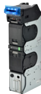
UBA Pro-RQ SH400 Cash Box