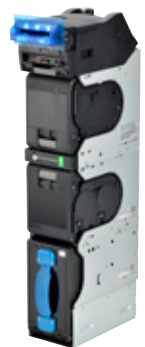
UBA Pro-RQ SS800 Cash Box