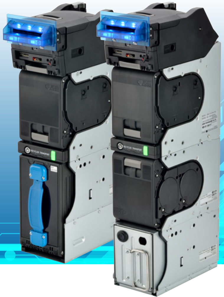
UBA Pro-RT SS800 Cash Box