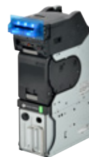
UBA Pro-RT SH400 Cash Box